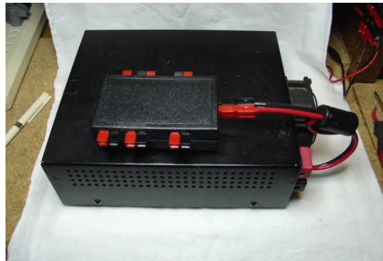
Photo B: Astron SS-25 power supply with snap-on ferrite & MFJ-1106.