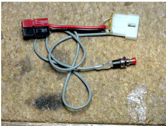
Simple IC-706/703/7000 tuning interface